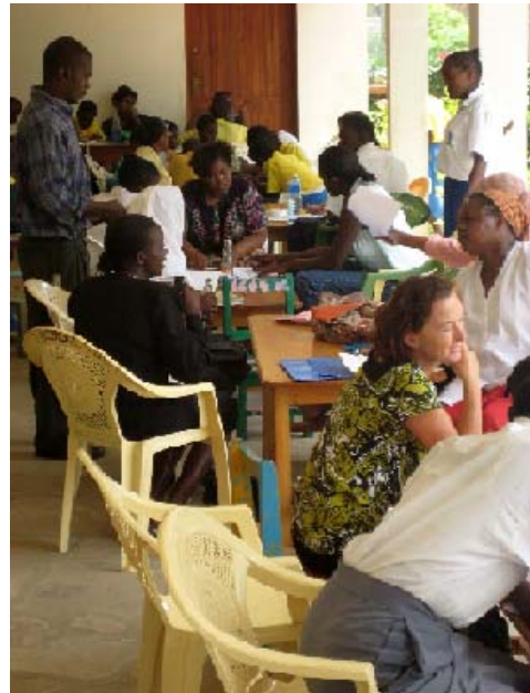
KESHO Day Dec 8 th 2007

KESHO Days would still continue as we all felt they provide an important opportunity for students and committee to meet. Their role, however, would be redefined by giving less emphasis on administration and more on the provision of counselling services, access to career/further education advice, & offering a forum for talks, craft, drama etc.